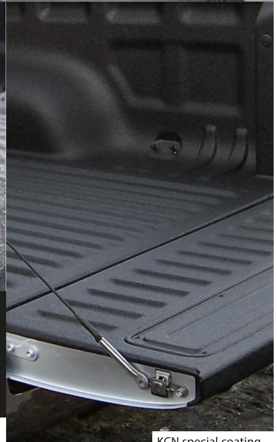
KCN special coating.